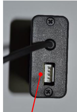
Passthrough Expansion Port